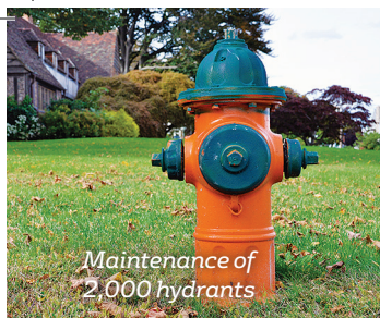
Maintenance of 2,000 hydrants