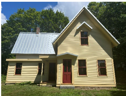
NEVINS COTTAGE EXTERIOR RENOVATION COMPLETED IN 2025 – INTERIOR PLANNED FOR 2026!