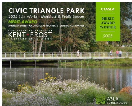
CTASLA MERIT AWARD WINNING ADA ACCESSIBLE TOWN PARK!

Management, focusing on how many vehicles the Town has in its fleet, maintenance of vehicles to extend life and budgeting for large vehicle replacement. In 2025, the Waterford Fire Department included its vehicles within the Fleetio Fleet Management system to ensure all town-owned vehicles, both small and large, are within the new fleet software program.