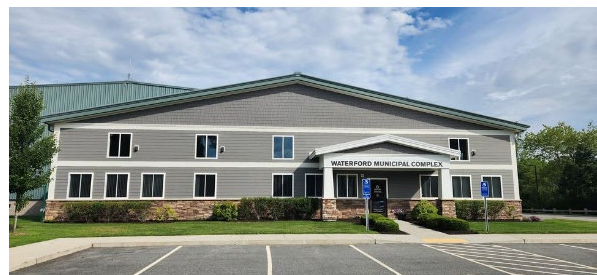
WATERFORD PUBLIC WORKS DEPARTMENT ENSURES OUR CAPITAL ASSETS ARE PROTECTED

In 2025, the Town received seven large pieces of apparatus for Public Works, including a Sweeper for $249,792, a Front Load Refuse Truck for $401,472, a new Chassis for the Tree Truck for $187,014, three DPW Dump Trucks for $389,344 and a Side Load Refuse Truck for $212,099. The Public Works Department and the Police Department fleet plans remain a priority, while future Fleet Plans will highlight fleet needs for the Waterford Fire Department. Although supply chain issues have occurred, the Town of Waterford remains in good position to purchase the fleet necessary to keep our town safe and operating efficiently. The Town continues to remove vehicles and equipment from the fleet in an effort to reduce the size of the fleet. The new Municipal Complex's 70,000 square foot garage continues to keep our trucks and other fleet equipment inside and protected from the elements. The DPW's incredibly important Tree Bucket Truck has been in the shop most of 2025 for extensive refurbishment. This critical piece of apparatus will ensure needed tree work will once again be in full operation come 2026! The First Selectman will continue to focus on Fleet