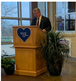
IN 2025, NEW CAMERAS, BALLARDS AND FENCING INSTALLED AT ALL THREE ELEMENTARY SCHOOLS AND NEW ARMED OFFICERS HIRED

In 2025, after completing or closing 24 approved and funded capital projects, ARPA projects and Lotcip/Locip projects, the Town of Waterford saw $4,012,462 invested in completed capital investments. The First Selectman’s office continues to support the funding for the Town’s Fleet Plan at $1M annually as well as the town’s retirement fund at $7.2M. The highlight capital project was the $2M school & community building security improvements, the largest capital project for school and community safety the Town has completed. The most complex part of this project, the video security cameras inside and around our schools, started in late 2024, and completed in 2025 despite significant supply chain delays.