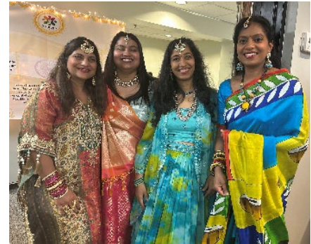
PROUD TO ATTEND THE 2025 SANGAM ASIAN HERITAGE EVENT

In 2025, the First Selectman participated in the Sangam Asian Heritage Event at the Waterford Library — a wonderful celebration of culture and community. In Indian culture, Sangam is a Sanskrit-origin word that means “confluence” or “coming together.” Attending this event provided an important opportunity to connect with more than 100 Waterford and regional residents, learn more about Sangam’s mission, and support the rich diversity that strengthens our community. Special thanks to the Waterford Public Library for hosting. Events like this remind us that understanding and celebrating different cultures brings us closer together and makes Waterford a more welcoming and inclusive place for all!