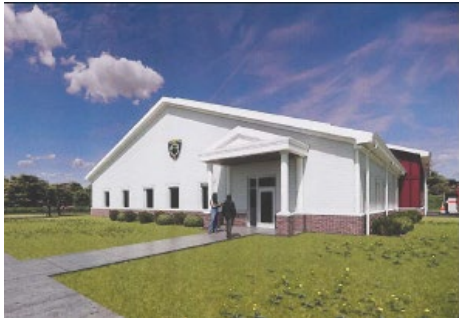
THE FUNDING FOR THE NEW OSWEGATCHIE FIRE STATION WAS APPROVED IN 2025

tax rate remains as stable as possible for the taxpayer. The 5-year “Snap Shot” Capital Plan, continues to identify projects that fall into the following four categories: road paving, building maintenance, park improvements and Board of Education requests, like the new Turf Field and Tennis Courts. The newly renovated Arnold E. Holm Jr. Memorial Park officially saw additional benches installed for residents who needed shorter walking distance between benches. The past year also saw the Gardiner Foundation donate $40,000 towards a much needed shade structure at the park’s playground, with the install scheduled for the spring of 2026. Road paving and town safety projects remained a priority. Road paving projects continue to include the Utility Commission replacing 30-year old plastic water connectors with copper piping, prior to road paving, eliminating the possibility of leaks forming under the newly paved roads. Finally, in a supportive bipartisan vote in town of 32-3 (Board of Selectmen 3-0, Board of Finance 6-0 and RTM 23-3) the building of a new town-owned firehouse was approved. The building and land was purchased by the town for $1 and will be the future home of the first town-owned fire station in Waterford. Construction is expected to start in early 2026.