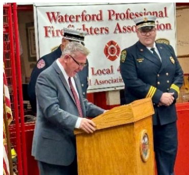
WATERFORD'S COMMITMENT TO INCREASING PAID FIREFIGHTER /EMT'S CONTINUED IN 2025

Through bipartisan collaboration, professionalism, and open dialogue in town, we have continued to move Waterford forward in meaningful ways. The Town continues to prioritize a working budget that supports capital investments, first responders, critical services and a level of education we expect in town, while