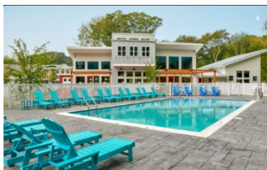
WATERFORD WOODS WITH 400 UNITS OF WORKFORCE HOUSING

In 2025, Waterford Woods Luxury Apartment Complex Phase Three was completed. The final 100 units for Phase Four is expected to be completed Spring 2026 and provide 425 units of 1 & 2 bedroom apartments of workforce and affordable housing. The impressive complex stretches over 35-acres and includes a clubhouse, indoor pool, pickleball court, walking trail, vegetable and herb gardens and