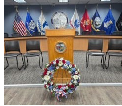
THE TOWN HALL AUDITORIUM NOW STREAMS TOWN MEETINGS LIVE VIA YOUTUBE & HOSTS VETERAN EVENTS DURING INCLEMENT WEATHER!

In 2025, the Town of Waterford saw the approval and start of the new Leary Park Pickleball Complex, Tennis Courts and Basketball Court, Town Hall Auditorium Renovation and ADA Accessible Restroom Project, the Mago Point Parking Lot, the Town Hall Basketball Courts and the new Waterford High School Turf Field and Tennis Courts. Outdoor parks, infrastructure and road paving with the General Fund Balance, CIP and CNR requests continue to be completed. All the while, public safety, town staffing levels and fleet management remain priorities for review. Waterford continues to host some of the largest retail shopping stores and plazas in and around Waterford Commons. Waterford is home to Dominion Energy's Millstone Power Station, the beautiful Great Neck Country Club, national chain restaurants and box stores and now a transformative mall property welcoming General Dynamics-Electric Boat Waterford Corporate Campus. These provide many benefits to our town as well as current and future tax revenue.