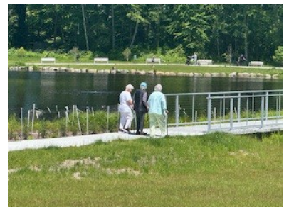
SENIORS ENJOYING THE ACCESSIBLE WALKWAY AROUND THE POND