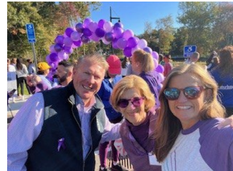
PROUD TO SUPPORT SAFE FUTURES ANNUAL WALK IN WATERFORD!

The Town of Waterford and the First Selectman's Office continues to support a number of community agencies and initiatives in addition to Veteran events in town and the region. The Town of Waterford continues to host the Safe Futures Annual Walk and looks forward to the groundbreaking of their new Family Justice Center in 2026 in Waterford! The First Selectman was proud to attend the 2025 Holland Club Induction Ceremony at the U.S. Navy Base in Groton. It was a great opportunity to support Waterford residents and