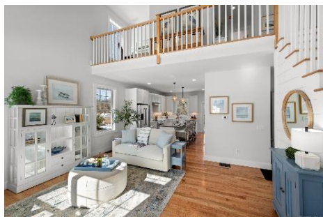
IVY HILL VILLAGE PROVIDES SMALLER HOMES OFFERING MODERN LIVING IN A BEAUTIFUL TOWN

The First Selectman's Office communicates with the three owners of the Crystal Mall property often. Discussions include several conceptual multi-use options that would include demolition and partial demolition of the structure. The Town and the Connecticut Department of Economic Development continue to discuss conceptual ideas for the project with the current Mall owners. The town's Board of Selectmen and RTM voted unanimously back in February 2023 to support Dominion Energy's interest in building data centers on its property, however, the CT Siting Council denied Dominion's initial permit application. There has been no application re-submitted to the Siting Council in 2024. Data centers on Dominion property would provide $8M annually for 30 years to the town if completed. The 40-home Ivy Hill Village residential project adjacent