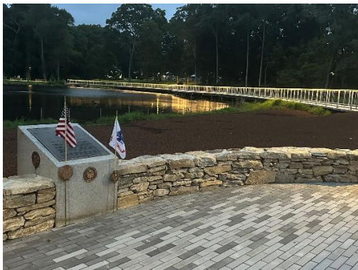
THE ARNOLD E. HOLM JR. MEMORIAL PARK GRAND OPENING

The newly renovated Arnold E. Holm Jr. Memorial Park officially opened this summer! The park renovations included ADA accessible pathways, lighting, a boardwalk, bridges, aerating pumps, basking logs for turtles, benches, a memorial plaza, stonewall, streetscape trees and additional lighting on Rope Ferry Road. I would like to thank the Recreation and Parks Commission and the Civic Triangle Ad Hoc Committee for their two-year commitment in overseeing the project. Most of the funding came from American Rescue Plan Act (ARPA), however, the dredging ($945,000), the final phase for ADA access ($273,428) and streetscape trees along Rope Ferry Road were supplemented from capital monies. The First Selectman's "Snap Shot" is a 5-year capital plan reflecting the responsible and transparent use of the General Fund Balance for capital projects. The "Snap Shot" helps ensure operating budgets stay intact and impact on the tax rate remains stable. Road paving