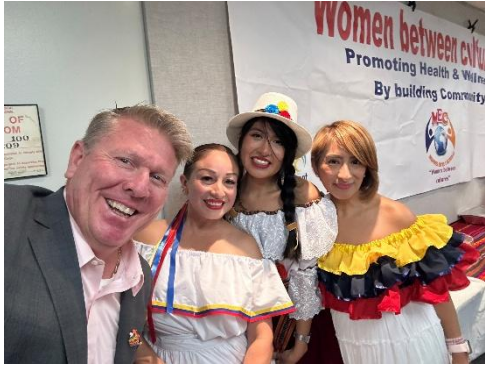
FIRST SELECTMAN BRULE CELEBRATING HISPANIC HERITAGE MONTH AT THE WATERFORD LIBRARY

maintains a strong relationship with the American Red Cross and continued to host monthly blood drives at Town Hall through 2024 as well as supporting the Thames River Garden Club's annual plant sale. In the Fall of 2024, I participated in the town's first Hispanic Heritage Month Celebration and was proud to present Town Proclamation to the "Women Between Cultures - Promoting Health and Wellness by Building Community" performers at the event. This event boasted amazing energy, great dancing and incredible people getting together to celebrate and