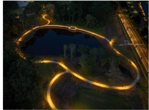
THE ARNOLD E. HOLM JR. MEMORIAL PARK SEEN HERE AT NIGHT

projects will continue to include the Utility Commission replacing 30-year old plastic water connectors with copper prior to road paving, eliminating the possibility of leaks forming under the newly paved roads. The Town's $2M request for funding school security improvements remains the largest capital project for school and community safety the Town has ever requested. The largest part of this project, the video security cameras inside and around our schools, started at the beginning of the 2024 summer.