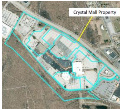
THE CRYSTAL MALL HAS SIX SEPARATE PARCELS ON THE PROPERTY OWNED BY THREE DIFFERENT COMPANIES

Commission for the effort put forward as we complete the final phases, including the online survey. Finally, the Planning & Zoning Commission and I worked closely all year with a consultant developing a draft Planned Development District (PDD) for the Crystal Mall property to encourage mixed-use development, provide flexibility for the owners and a much needed tax revenue for Waterford residents. The town continues to look for new economic development that will have long-term effects and will enhance our Net Taxable Grand List.