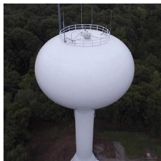
THE 750,000 GALLON FARGO ROAD WATER TANK $1.3M REHABILITATION PROJECT

All expected American Rescue Plan Act (ARPA) funding from the federal government has been received by the Town of Waterford ($5,547,889) and was encumbered, per law, by December 31, 2024. The allocation the Town of Waterford received from ARPA and the plan to spend the funding was submitted to the RTM – appropriating the funding to emergency service upgrades, small businesses, tourism, mental health needs, water utility upgrades/maintenance and outdoor parks. All appropriations are provided to the Board of Selectmen, Board of Finance and the RTM in quarterly updates on to ensure transparency.