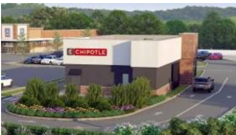
CHIPOLTE MEXICAN GRILL OPENED IN 2024

on the town. The Town of Waterford is currently completing the town's Plan of Conservation and Development. "Plan Waterford" is our Town's guide for the future. It shows where we have been and lays out the vision for where we are going. Thank you to the staff and Planning & Zoning