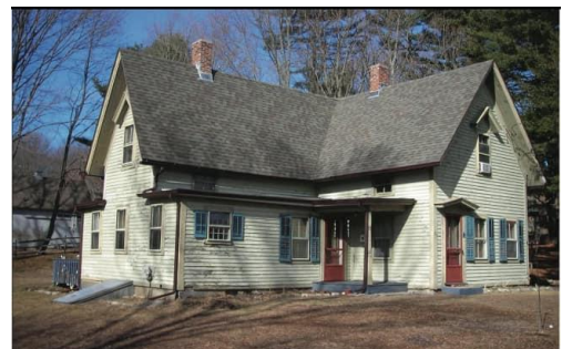
THE FRIENDS OF NEVINS COTTAGE, INC. WAS CREATED IN 2024 TO RESTORE AND MAINTAIN THE HISTORIC NEVINS COTTAGE