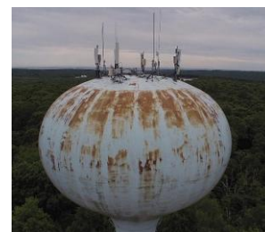
THE FARGO ROAD TANK PRIOR TO THE ARPA PROJECT STARTING

All expected American Rescue Plan Act (ARPA) funding from the federal government has been received by the Town of Waterford ($5,547,889) and was encumbered, per law, by December 31, 2024. The allocation the Town of Waterford received from ARPA and the plan to spend the funding was submitted to the RTM – appropriating the funding to emergency service upgrades, small businesses, tourism, mental health needs, water utility upgrades/maintenance and outdoor parks. All appropriations are provided to the Board of Selectmen, Board of Finance and the RTM in quarterly updates on to ensure transparency.