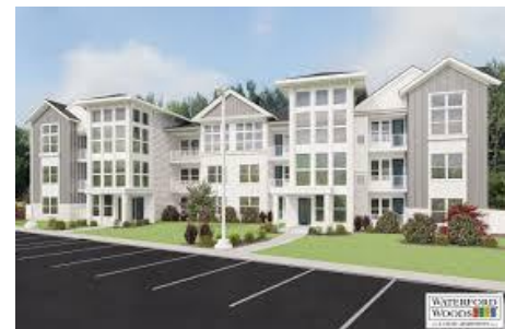
WATERFORD WOODS LUXURY APARTMENTS COMPLEX WILL ADD TAX REVENUE TO THE TOWN

The Town continues to share a positive working relationship with Dominion Energy and successfully negotiated a tax appeal in 2024.