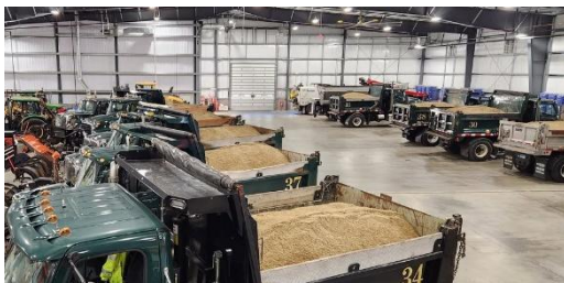
THE PUBLIC WORKS FLEET PARKED INSIDE THE MUNICIPAL COMPLEX GARAGE READY FOR INCLEMENT WEATHER

In 2024, the Town received three large pieces of apparatus for Public Works, including a Sweeper for $348,209, a 5-ton Dump Truck for $276,695 and a Side Load Refuse Truck for $391,997. The Public Works Department and the Police Department fleet plans remain a priority. As supply chain issues have occurred, the Town remains in good position to purchase the fleet necessary to keep our town safe and