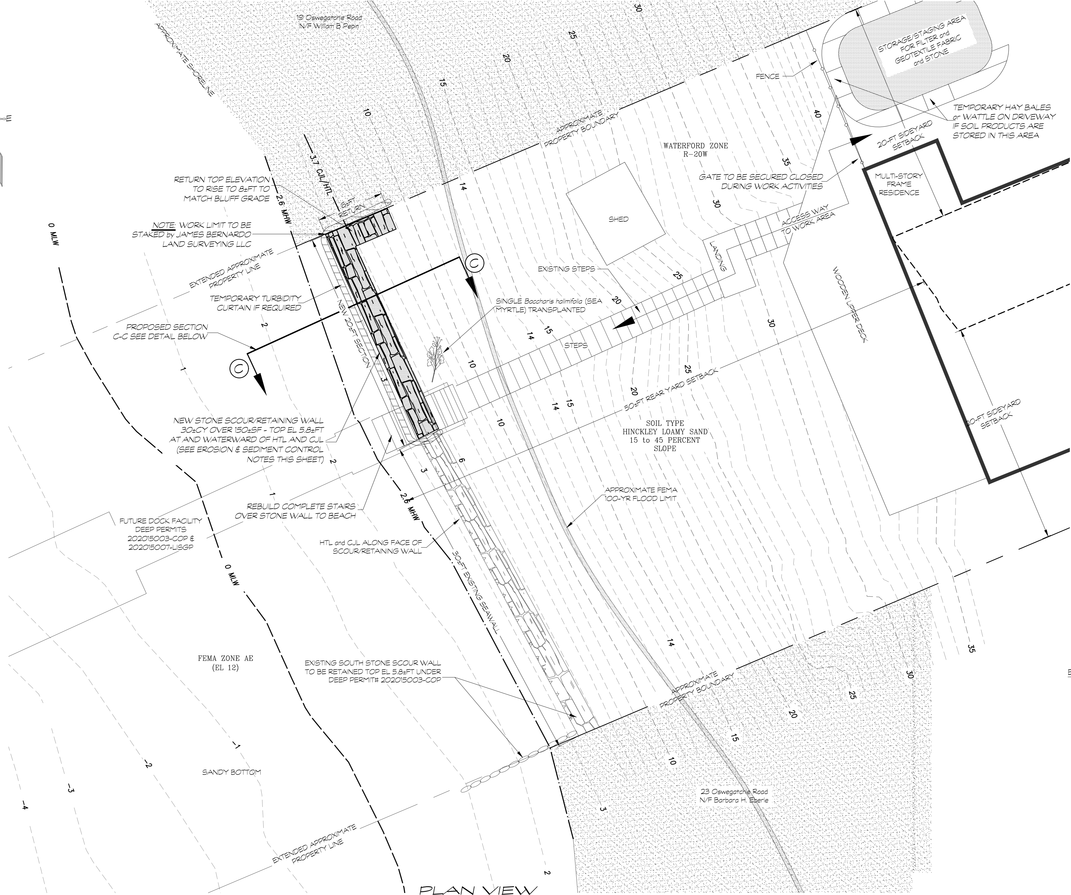
PLAN VIEW GRAPHIC SCALE 1" = 5' 5 4 3 2 1 0 5